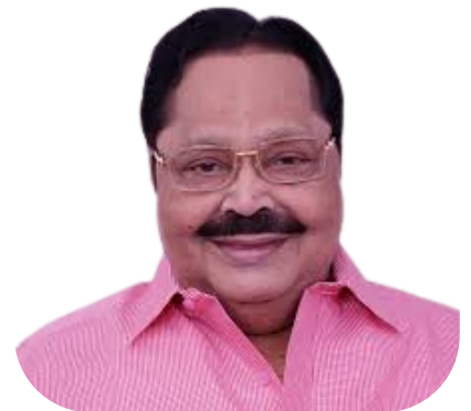
Thiru. Duraimurugan Honourable Minister for Law and Pro-Chancellor, TNNLU