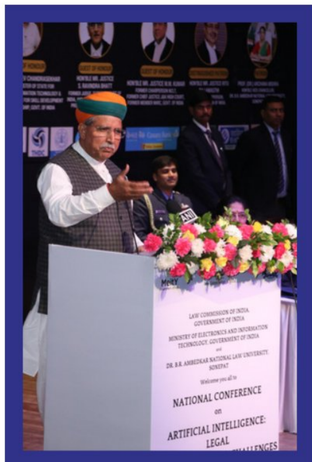
SHRI ARJUN RAM MEGHWAL MINISTER OF LAW AND JUSTICE, GOVERNMENT OF INDIA