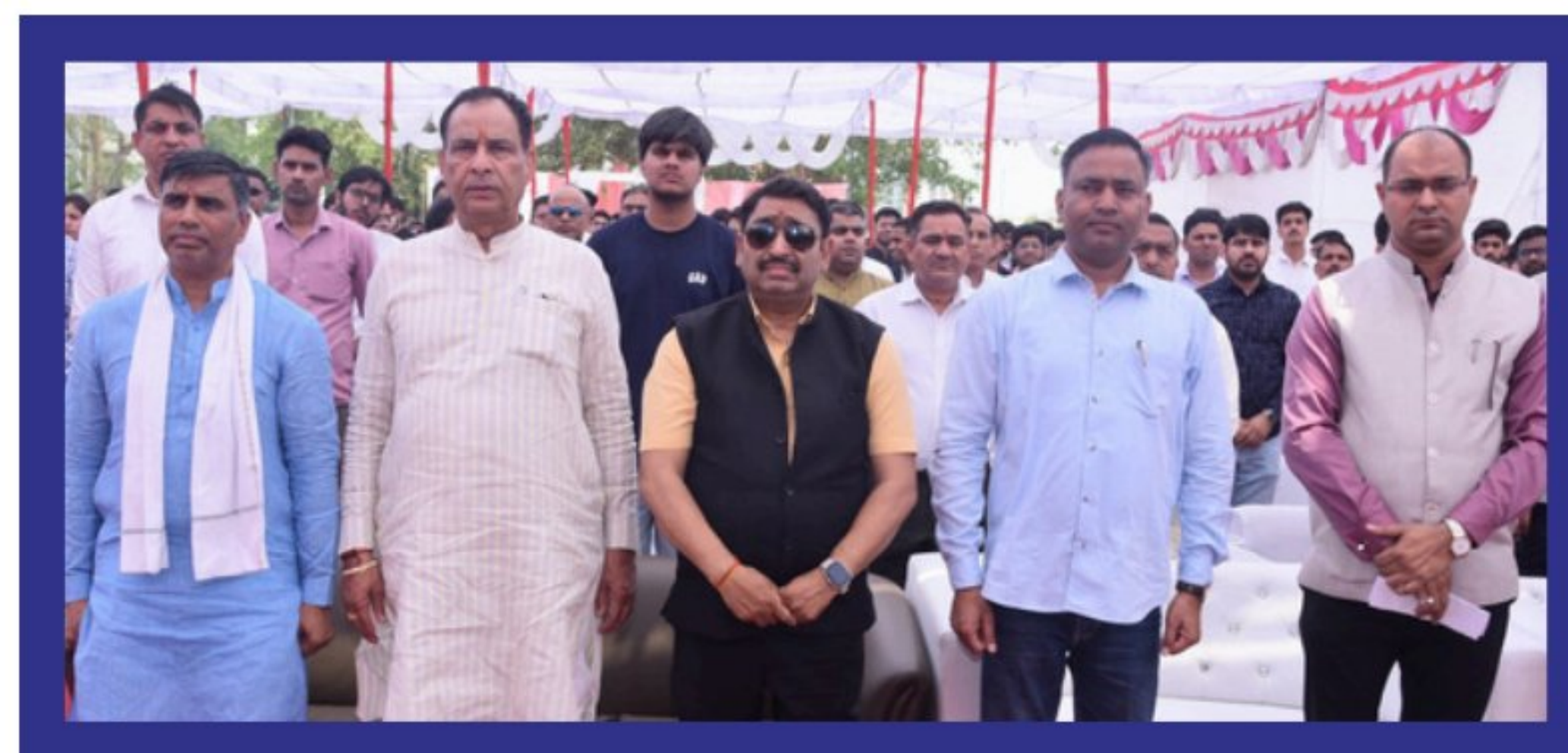
SHRI MAHIPAL DHANDA HON'BLE EDUCATION MINISTER GOVERNMENT OF HARYANA