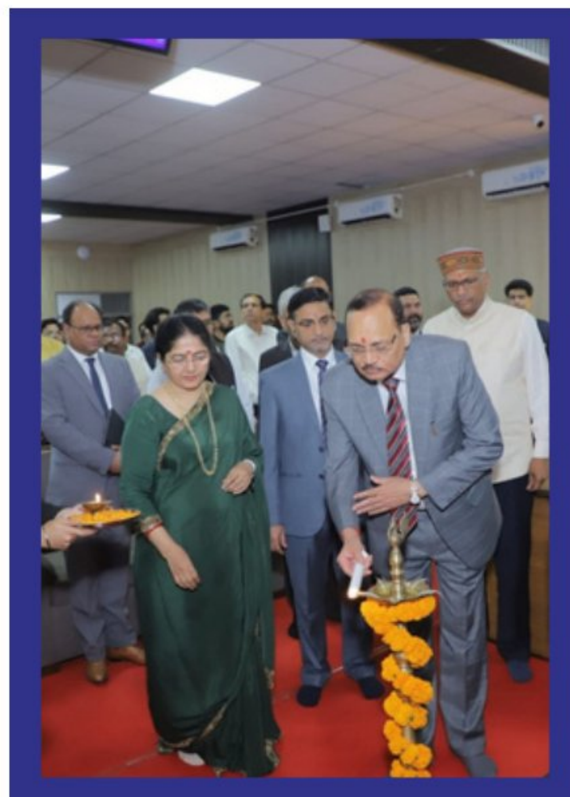
HON'BLE MR. JUSTICE SURYA KANT, JUDGE SUPREME COURT OF INDIA