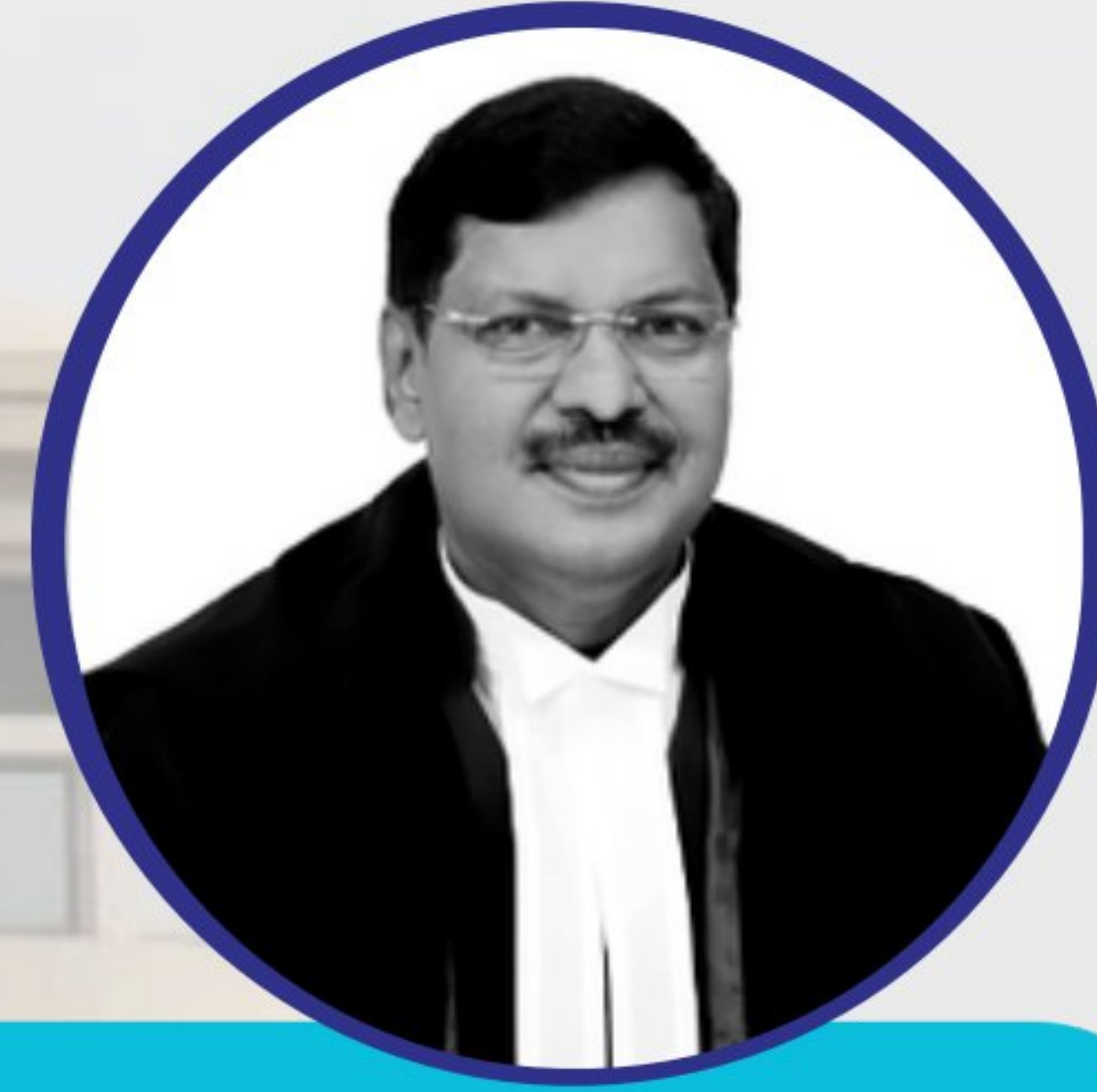
HON'BLE MR. JUSTICE BHUSHAN RAMKRISHNA GAVAI

HON'BLE GOVERNOR OF HARYANA & CHANCELLOR OF DR. B.R. AMBEDKAR NATIONAL LAW UNIVERSITY, SONEPAT