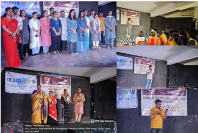
LEGAL AWARENESS CAMP HELD ON 24TH MARCH, 2024