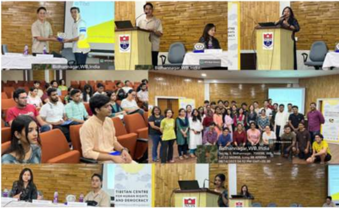
THE VISIT OF TIBETAN CENTRE FOR HUMAN RIGHTS AND DEMOCRACY HELD ON 14TH AUGUST, 2023