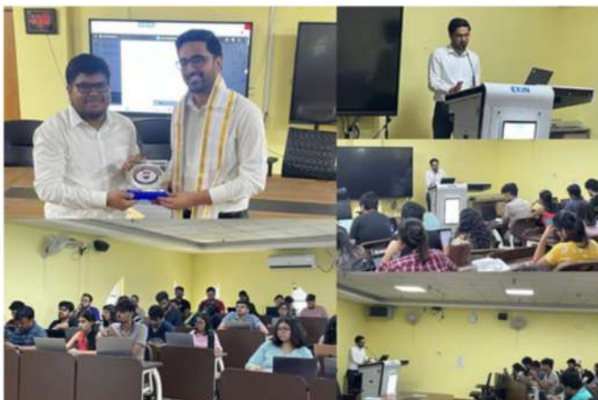
LECTURE ON PRACTICAL ASPECTS OF ARBITRATION, 2024