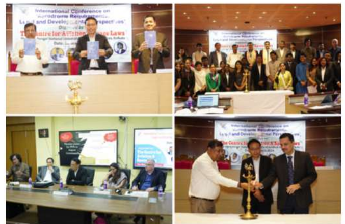
INTERNATIONAL CONFERENCE ON 'AERODROME REQUIREMENTS: LEGAL AND DEVELOPMENTAL PERSPECTIVES' HELD ON 30TH MARCH, 2024