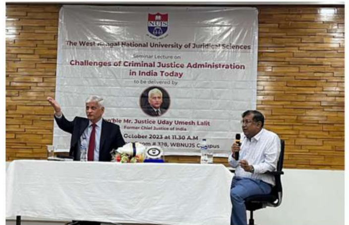
SEMINAR LECTURE BY HON'BLE MR. JUSTICE UDAY UMESH LALIT, FORMER CHIEF JUSTICE OF INDIA HELD ON OCTOBER, 2023