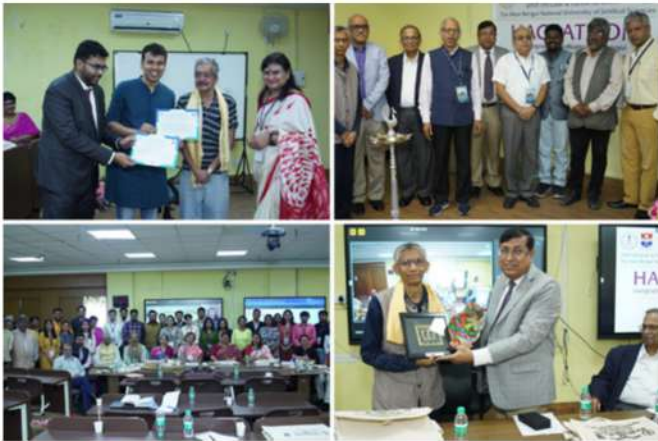
HACKATHON ON GEOGRAPHICAL INDICATION AND RELATED TK& TCEs HELD ON 8TH-10TH MARCH, 2024