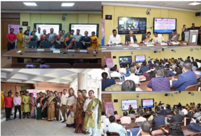
SENSITIZATION AND LEGAL AWARENESS PROGRAM ON TRANSGENDER RIGHTS AND THE LAW 5TH SEPTEMBER, 2023