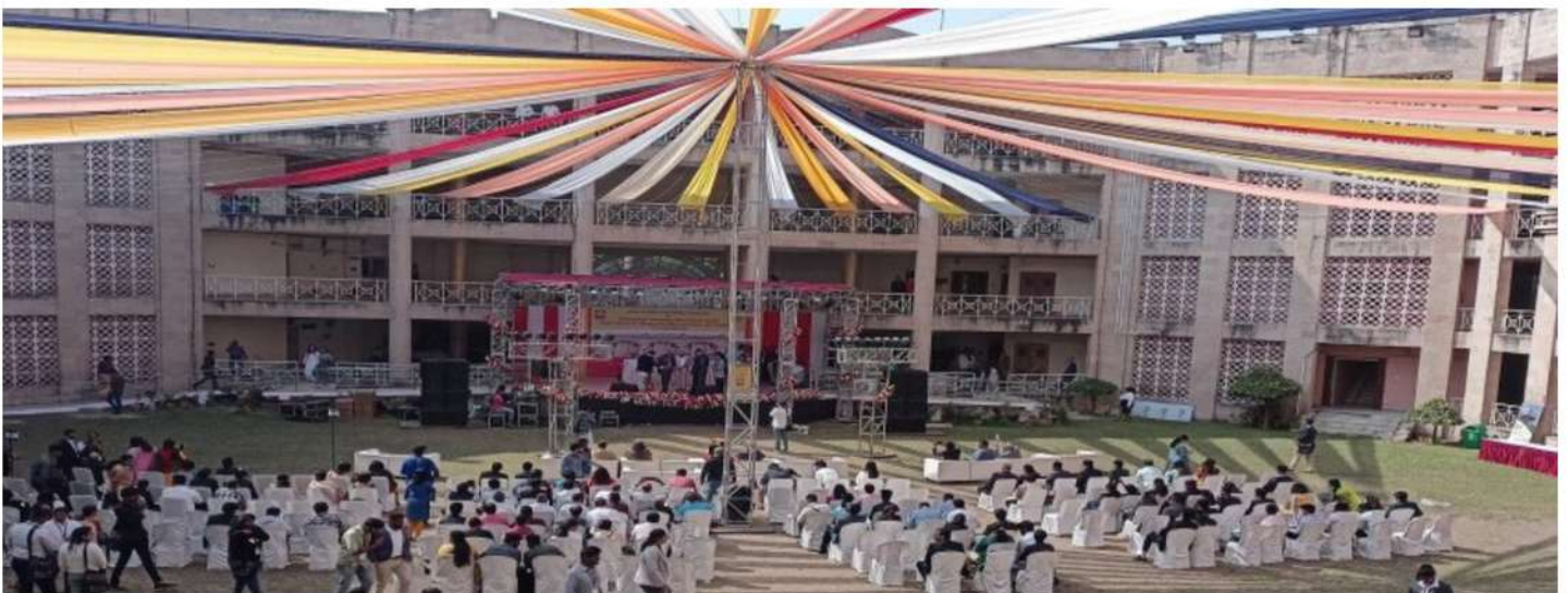
43rd ALL INDIA CRIMINOLOGY CONFERENCE HELD ON 17TH-19TH DECEMBER, 2022