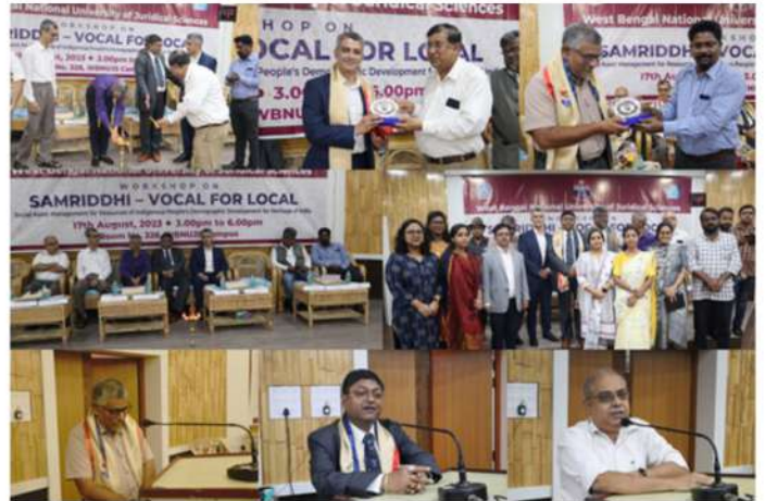
WORKSHOP ON SOCIAL ASSET MANAGEMENT FOR RESOURCES OF INDIGENOUS PEOPLE'S DEMOGRAPHIC DEVELOPMENT FOR HERITAGE OF INDIA (SAMRIDDIHI - VOCAL FOR LOCAL) HELD ON 17TH AUGUST 2023