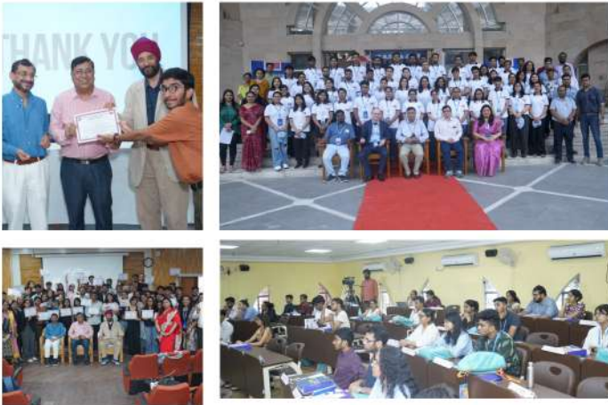
SUMMER SCHOOL ON FINANCIAL REGULATIONS AND CORPORATE LAW HELD ON 18TH -29TH JUNE 2024