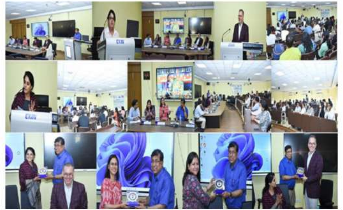
WORKSHOP ON WOMEN AND IP: ACCELERATING INNOVATION AND CREATIVITY HELD ON 24TH APRIL, 2023