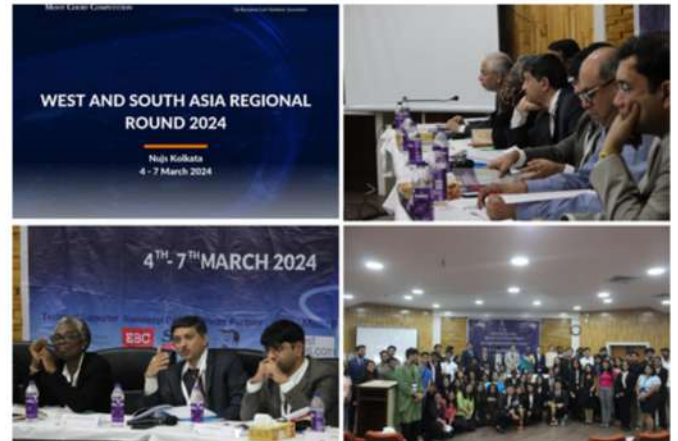
THE 22ND JOHN H. JACKSON MOOT COURT COMPETITION HELD ON 4TH-7TH MARCH, 2024