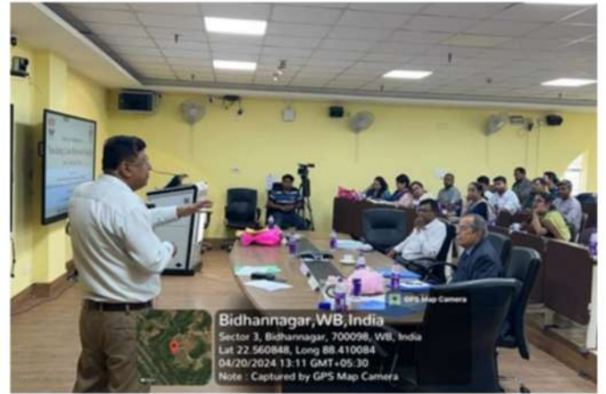
WORKSHOP ON TEACHING LAW BEYOND GOOGLE HELD ON 20TH APRIL, 2024