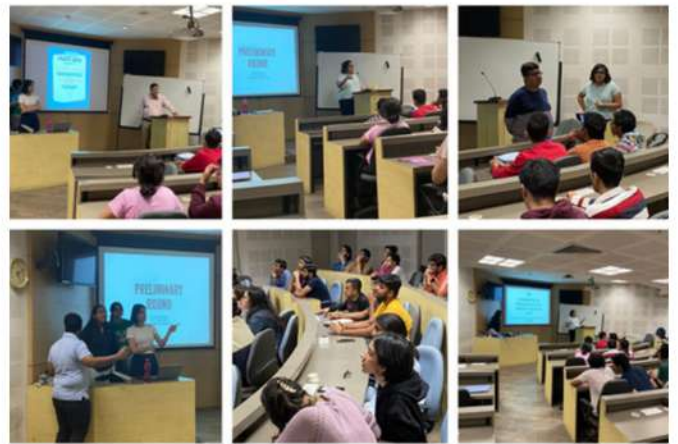
CONSTITUTION DAY OR "SAMVIDHAN DIVAS" OF INDIA HELD ON 26TH NOVEMBER, 2023