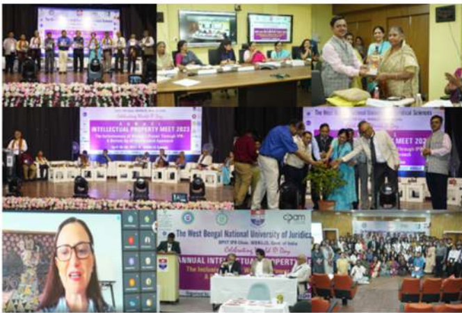
WBNUJS IP MEET 2023 HELD ON 29TH -30TH APRIL, 2023