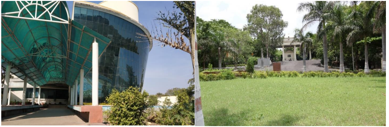
A View of the NLIU Campus