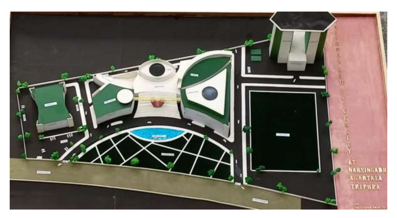
Architectural Model of NLU Tripura

The proposed architectural model of NLU Tripura presents a modern university campus, which has been designed as a complex of buildings: educational spaces including library, moot court hall, auditorium, social spaces, halls of residence, canteen, and areas dedicated to sports and recreational activities. The construction is likely to be completed by June 2024.