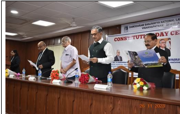
Constitution Day Celebrations on 26.11.2023

Investigation (Inter-University)” National Level Competition 4.0. Virtual Round Table Conference on “Role of Commercial Courts in Improving Ease of Doing Business Ranking”. Webinar - “Corporate Funding & Listing in Stock Exchanges”. 3rd Edition of Prof. (Dr.) N. R. Madhava Menon National Parliamentary Debate. Dristikon 2nd edition of the panel discussion on a fascinating topic "The PMLA Judgment: A tussle between powers and rights". The panel discussion. “World News Day Celebrations” Organized by Students Newsletter Committee (SNL) and CIPR & T DSNLU.