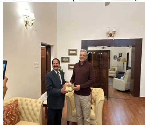
Meeting with Hon'ble Sri Justice P.S.Narasimha, Judge, Supreme Court of India & Hon'ble Visitor, DSNLU