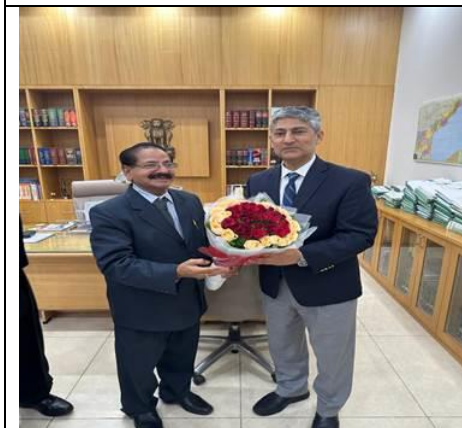
Meeting with Hon'ble Sri Justice Dhiraj Singh Thakur, Hon'ble Chief Justice, High Court of Andhra Pradesh & Hon'ble Chancellor, DSNLU