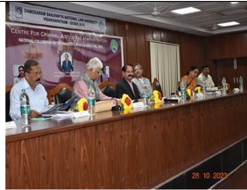
Seminar on National Colloquium on Bhartiya Nyaya Sanhita Bill 2023 (28th & 29th October, 2023)