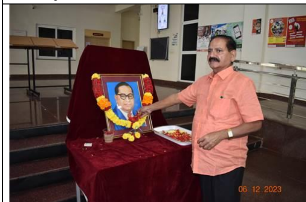
Mahaparinirvan Diwas, Dr. B. R. Ambedkar's 67 th Death Anniversary at DSNLU